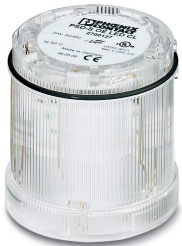
LED permanent light element, 24 V AC/DC, clear

Please be informed that the data shown in this PDF Document is generated from our Online Catalog. Please find the complete data in the user's documentation. Our General Terms of Use for Downloads are valid ( http://phoenixcontact.com/download )